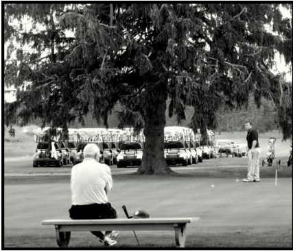
PRACTICE ON THE PUTTING GREEN