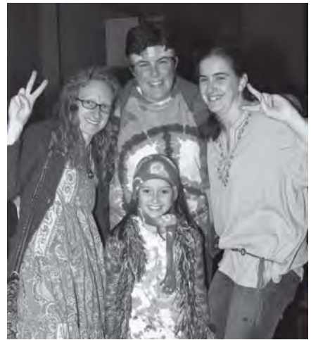
Best Name: Traveling Trivia Tree Huggers

Project G.R.A.C.E. would like extend a huge thank you to the participants, sponsors and supporters. The Bee raised friends and funds...over $6,000! We offer a special note of thanks to the Town of Scarborough, the School Committee and the staff of the High School Auditorium for their expertise and support.